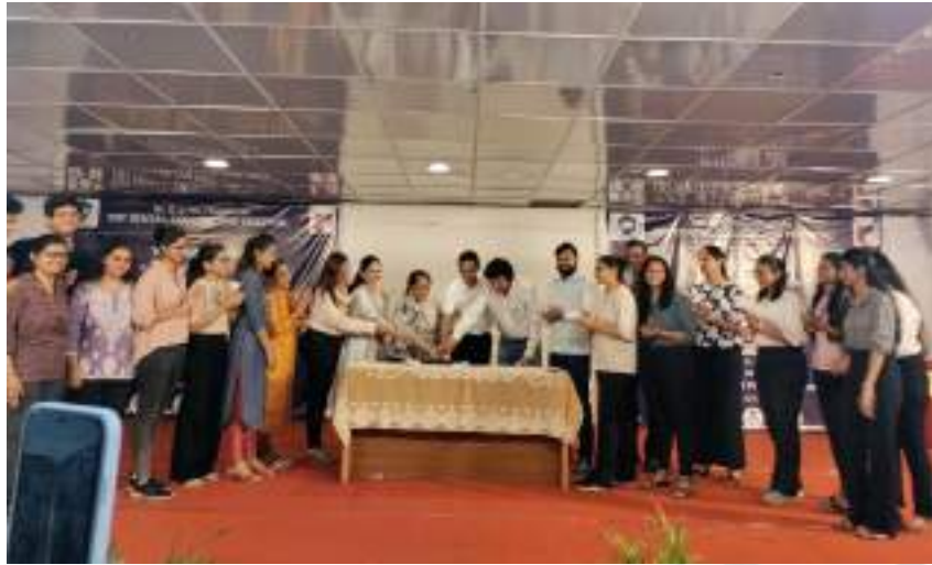
Sensitisation of Dental Task Force And Unveiling of IPR Unit