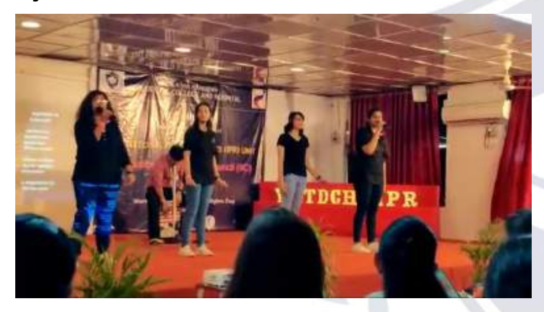
The Innovation Anthem